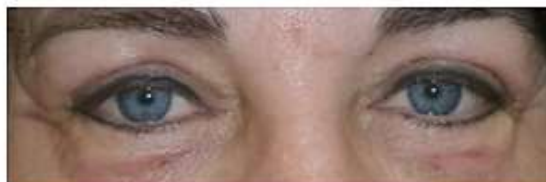
10 days after treatment